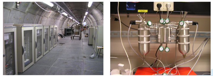
Left: On-line water and gas sampling/analysis systems installed as part of the PRACLAY Heater test to monitor the chemical evolution upon heating. Right: Newly designed set-up for the measurement of gas diffusion coefficients through Boom Clay plugs.

Within the frame of the European project TIMODAZ, the importance of these various thermo-chemical processes on the mineral stability of Boom Clay are identified and assessed. Special attention is paid to the analysis of safety-relevant clay properties, e.g. swelling, cation-exchange capacity, surface area and hydraulic conductivity. Besides different laboratory studies, SCK•CEN, EIG EURIDICE and ONDRAF/NIRAS carry out a large-scale in situ Heater Test (the PRACLAY Heater experiment, figure below left) in which the thermo-hydro-mechanical-chemical behaviour of the clay environment upon heating will be monitored and studied for a long period on a true scale.