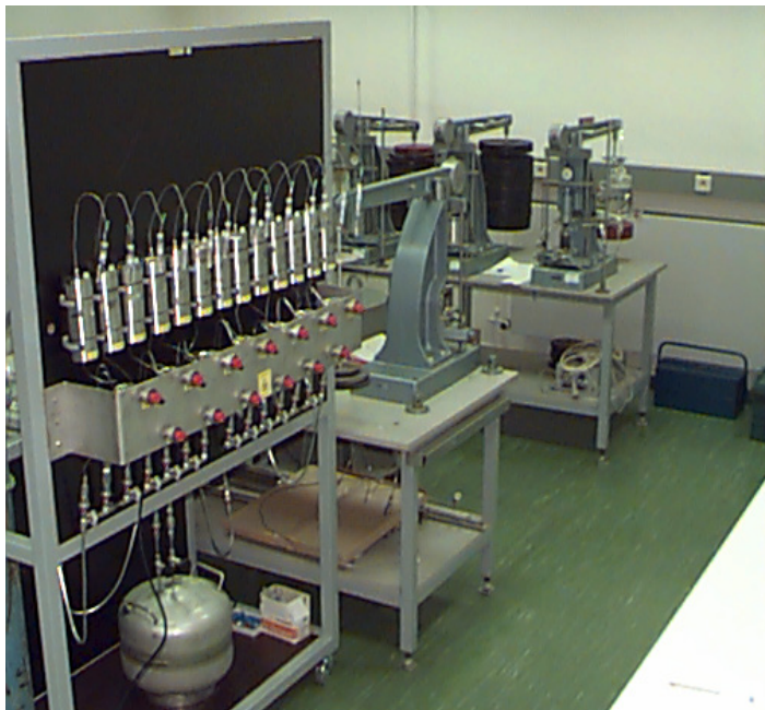
Figure 3: Experimental set-ups used for the direct measurement of radionuclide migration parameters.

For many years, SCK•CEN made a lot of efforts on the direct measurement of radionuclide migration parameters in Boom Clay (figure 3). This pioneering work enabled SCK•CEN to build up an important experience in this field and a huge amount of data is available. However, there remain still open questions and the interpretation of migration experiments is not always straightforward. Therefore, the transport of radionuclides which may escape from the waste packages is studied both, on small scale representative core samples in the surface labs and at large-scale in the Underground Research Laboratory HADES, 225 m under the SCK•CEN site. These experiments try to mimic as close as possible the real situation and can as such be used directly as demonstration. In order to understand the underlying processes of radionuclide migration/retention, detailed studies on the interaction of radionuclides with natural organic matter (e.g. colloid formation), their sorption, solubility and speciation are needed.