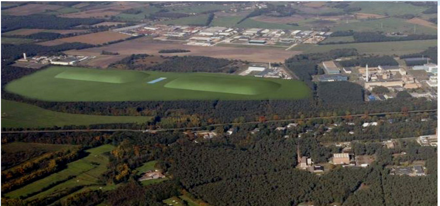
Proposed location for the Belgian near surface disposal facility for short-lived low and intermediate level radioactive waste (category A waste).

We develop and evaluate biogeochemical transport models to address migration of radionuclides and major and minor elements in the environment, for example in the surroundings of a near surface disposal site. Analysis of radionuclide and heavy metal migration is also done for areas contaminated as a result of uranium mining and milling activities, or for soils receiving surface-applied chemicals such as fertilizers.