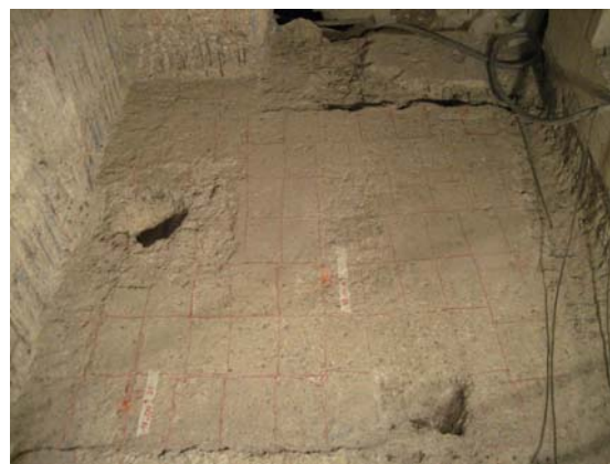
Floor of room 18: present situation after decontamination