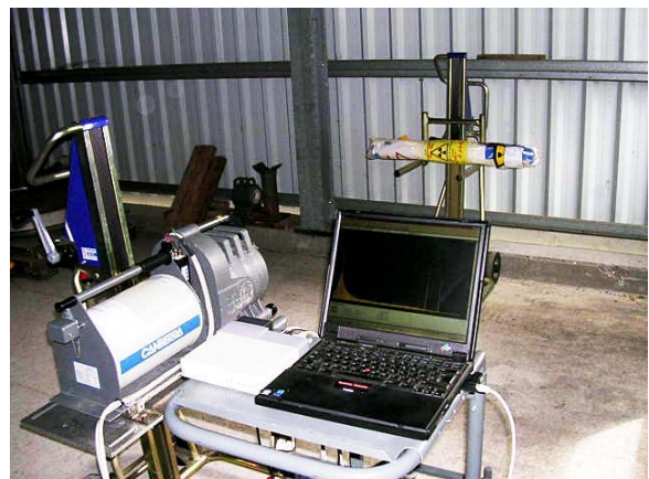
The ISOCS: a portable HPGe detector, Multi Channel Analyser and modelling tools

The Canberra ISOCS (In Situ Object Counting System) is a mobile gamma spectroscopy unit based on a fully characterized (> 45 keV) HPGe (high purity germanium) detector accompanied with modelling tools.