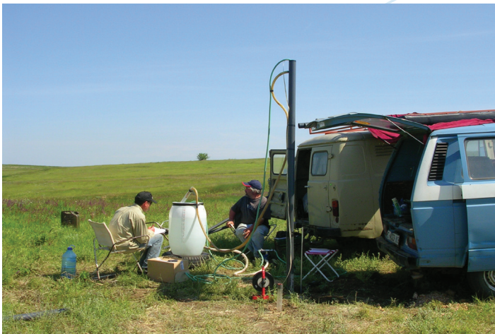
Field investigations to determine site parameters for a surface repository for the disposal of low-level radioactive waste in Bulgaria.

Through its involvement in projects outside the Belgian repository development programme, SCK•CEN has attained worldwide recognition as the leading research organisation in the field of investigations on the disposal of radioactive waste in a clay-based environment. Active participation in these projects has allowed to maintain, to apply and to further expand knowledge in specific areas of competence as well as to anchor research performed at SCK•CEN in a broader international context.