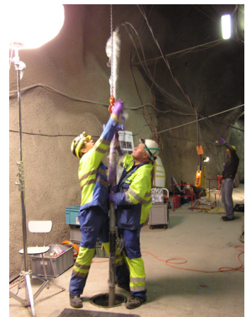
The Mont Terri Underground Laboratory (Switzerland) and installation of the Bitumen-Nitrate Interaction experiment.

Contact Alain Sneyers alain.sneyers@sckcen.be Tel. + 32 14 33 31 37